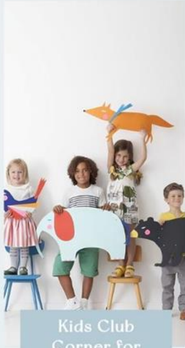
Kids Club Corner for Lagoon