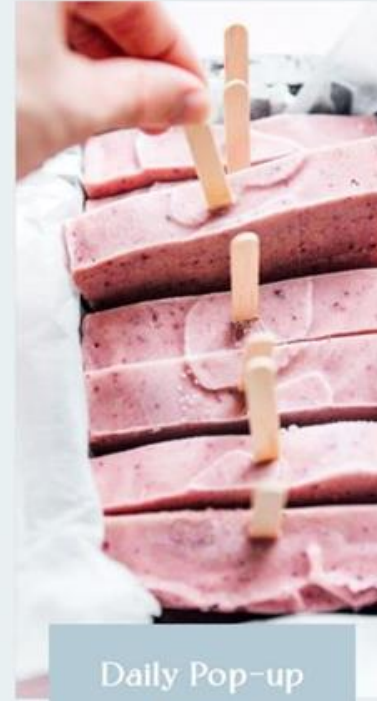
Daily Pop-up Treats