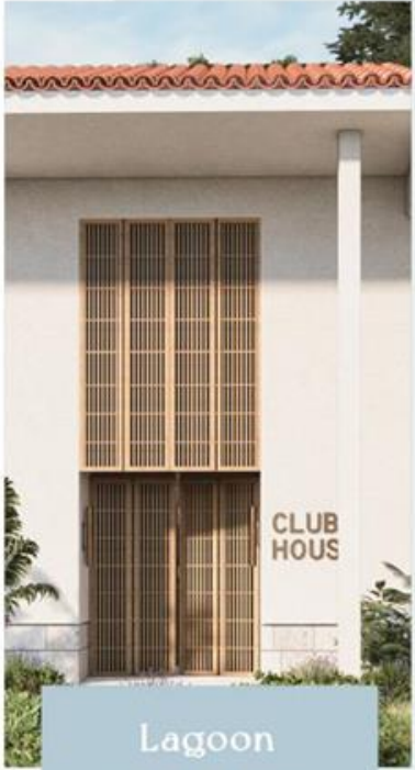
Lagoon Club House