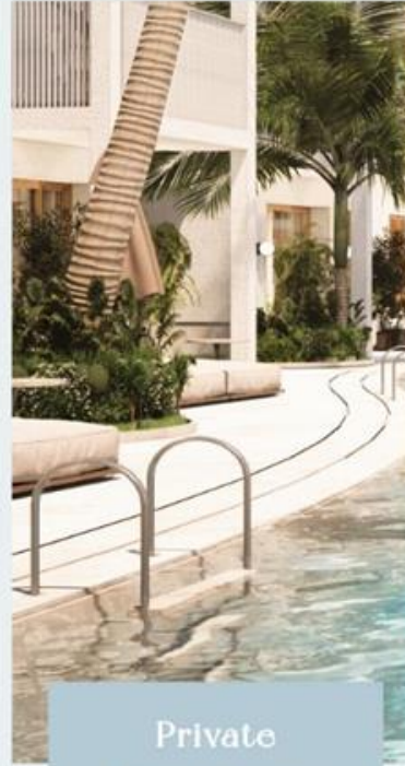
Private Pool & Bar