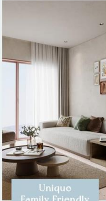
Unique Family Friendly Comfort